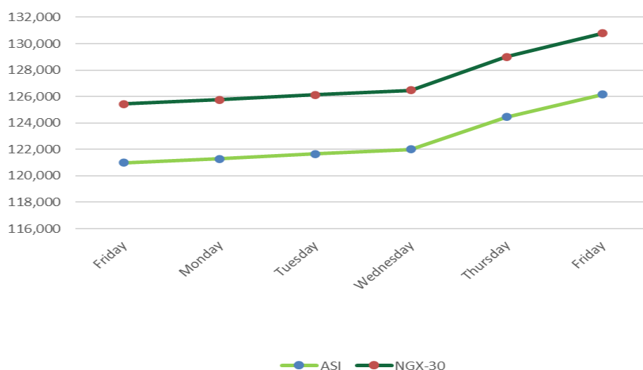
The NGX All-Share and NGX-30 Indices Week Ended July 11, 2025